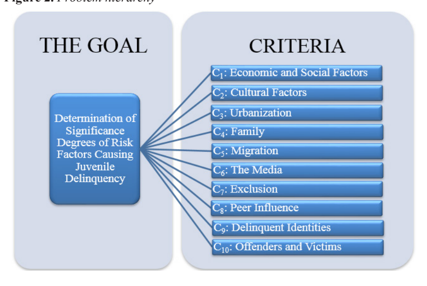
Figure 2. Problem hierarchy

As for the decision criteria, the causes of juvenile delinquency, approved by the experts, are taken into consideration and are explained in detail in Section 1.1. The problem hierarchy, showing the goal and the risk factors causing juvenile delinquency (decision criteria) and their abbreviations, is presented in Fig. 2.